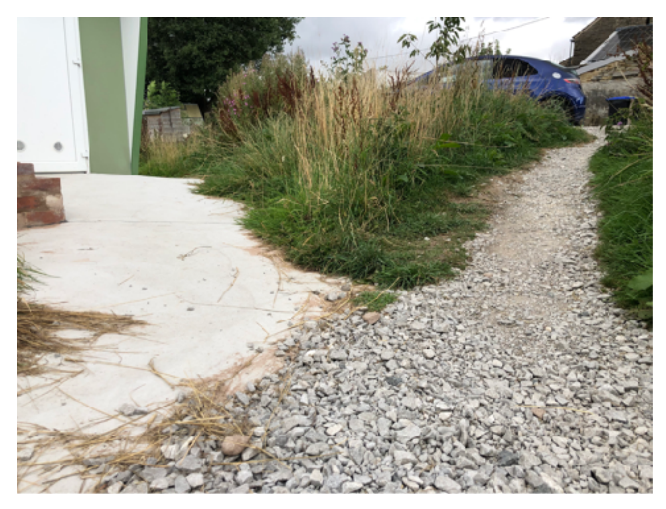
[Picture of gravel path continuing up past the disabled toilet/shower unit to the main toilet/shower & washing up block. Main facilities are to the right of the blue car in the picture]