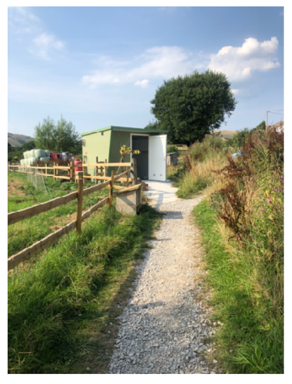
[Picture of 10 meter section of gravel path leading to concrete area outside the disabled toilet/shower unit.]

At the end of this 10 meter section of gravel path there is a concrete area to the left which has a slight uphill incline for 4.9 meters leading to the disabled toilet/shower unit.