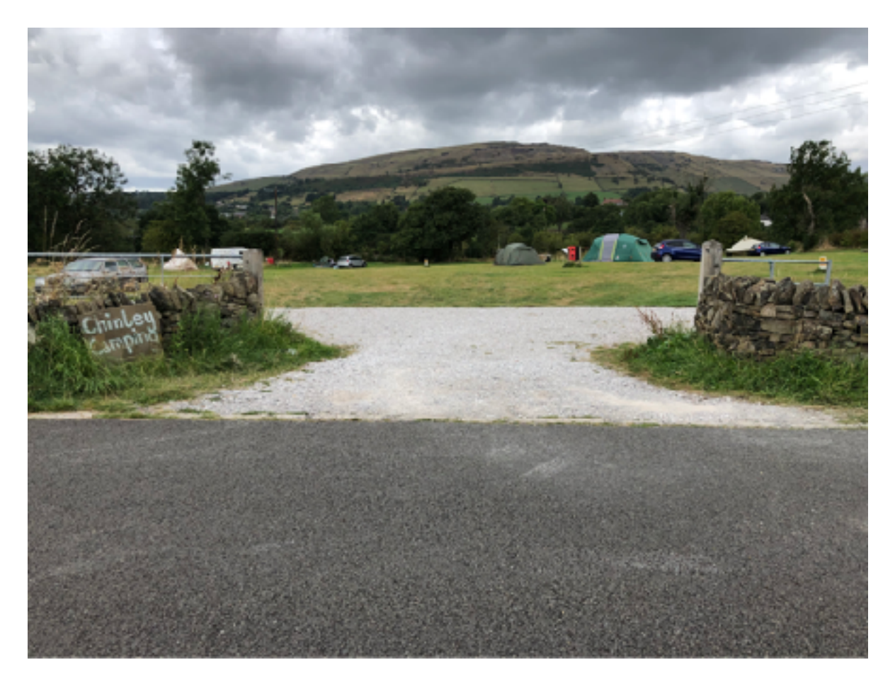
[Picture showing entrance gate way to the camping field & the Chinley Camping sign]

The campsite entrance is marked by a sign that says Chinley Camping. This sign leans on the dry stone wall to the left hand side of the entrance gateway. It stands on the ground and is about 800mm high. It has white writing on a pale brown background.