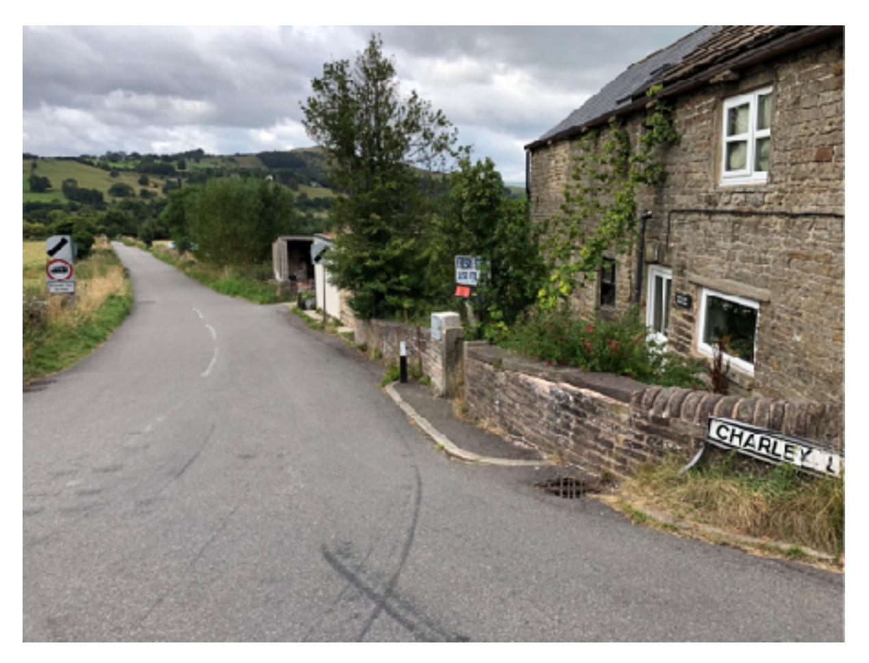
[Picture showing Charley Lane, the farm house, outbuilding and eggs for sale]

The campsite is accessed directly from Charley Lane through a wide gateway with a metal farm gate, which is always left open. After turning from Buxton Road into Charley Lane the campsite entrance is the second gateway on the right, just past a stone farm house with eggs for sale on the front wall, and a collection of small out buildings.